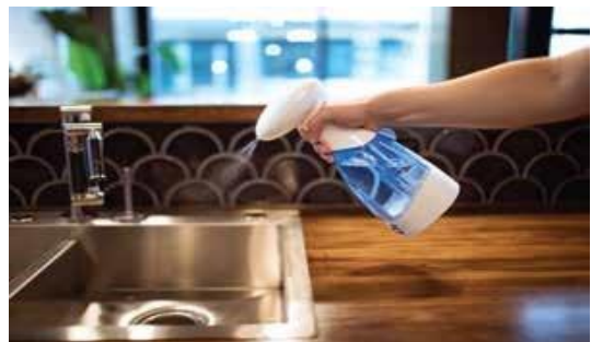
Figure 1. Enozo Technologies, Inc. SB100 Aqueous Ozone Spray Bottle

effects of closer exposure of edge and corner wells to atmospheric conditions.