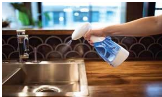
Figure 1. Enozo Technologies, Inc. SB100 Aqueous Ozone Spray Bottle

effects of closer exposure of edge and corner wells to atmospheric conditions.